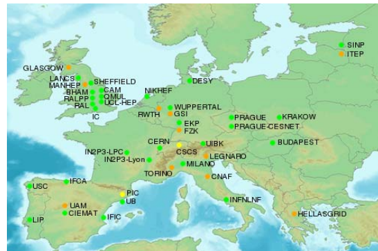
Figure 1: A snapshot of the European LCG sites in June 2004. There are also sites (not shown) in Taiwan, Japan and America. For a live map see the LCG operations website 6 .

Deploying low level tools, such as Globus 5 , does not in itself produce a computing Grid. To enable a diverse set of users scattered throughout the world to access such a Grid requires several “value-added” components. GridPP and EDG developed good working prototypes for all of these, and in this section they are reviewed.